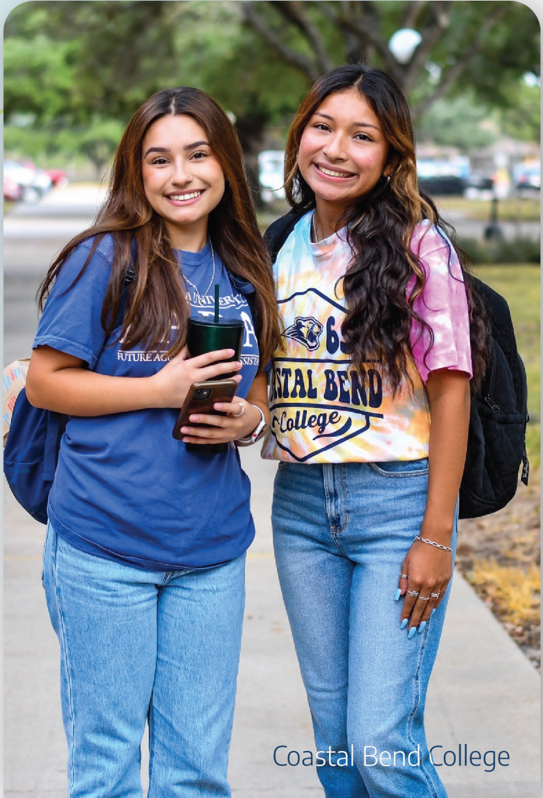
Coastal Bend College