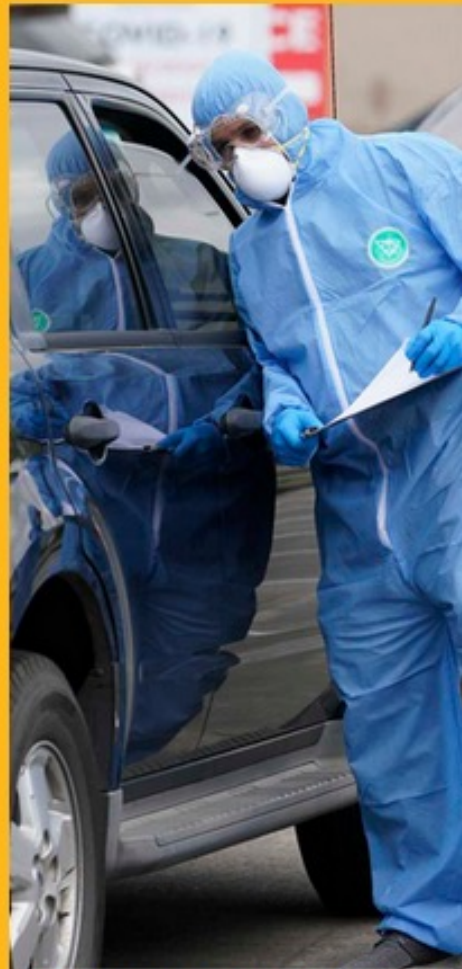
COVID-19 GLOBAL PANDEMIC