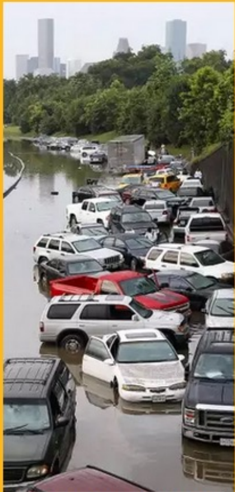
2015 MEMORIAL DAY FLOOD