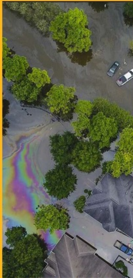
2017 HURRICANE HARVEY