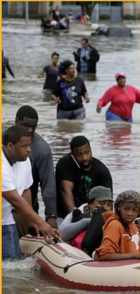
2016 TAX DAY FLOOD